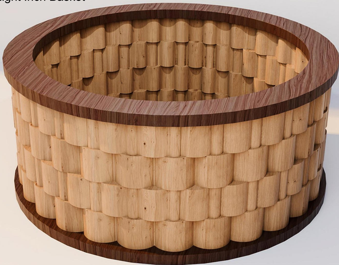
Eight Inch Basket