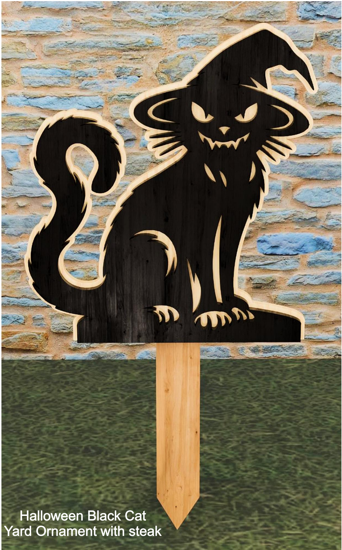
Halloween Black Cat Yard Ornament with stake