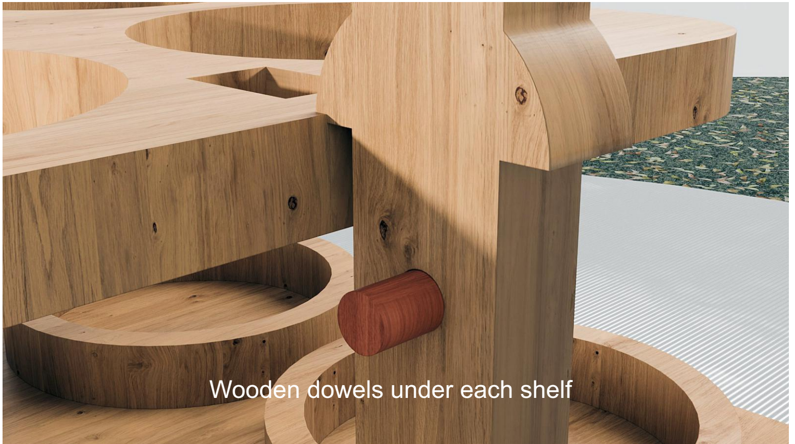
Wooden dowels under each shelf