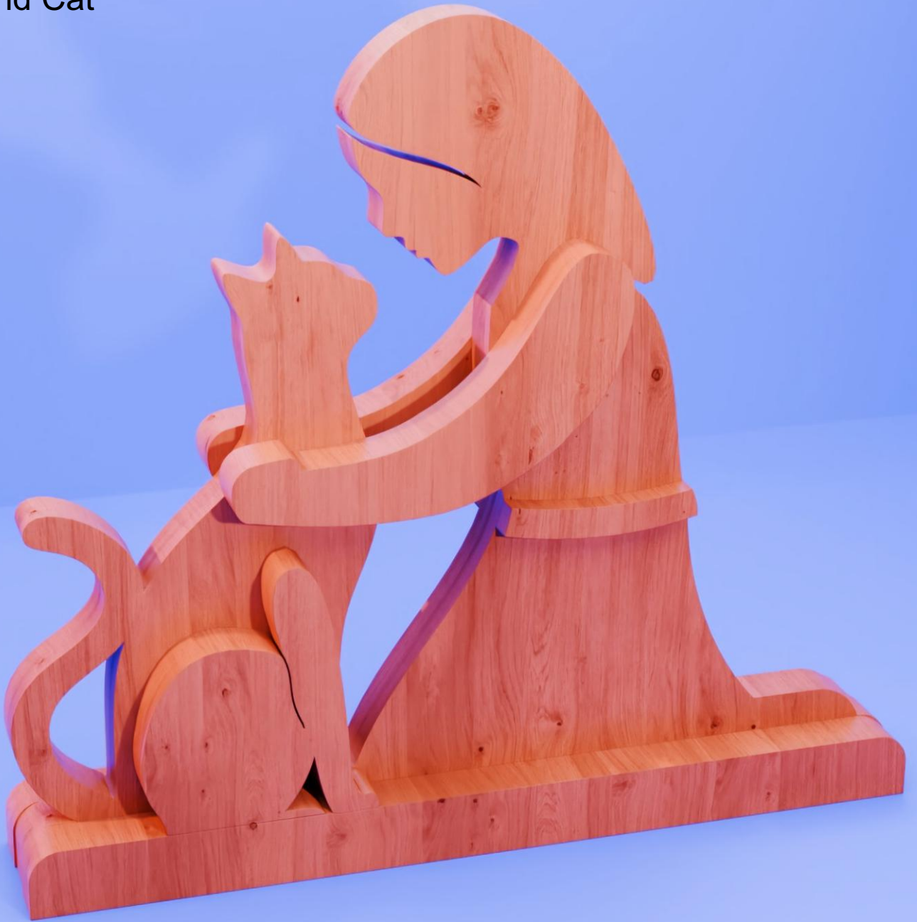
Girl and Cat