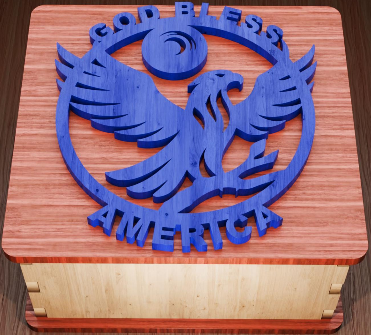
God Bless America Box