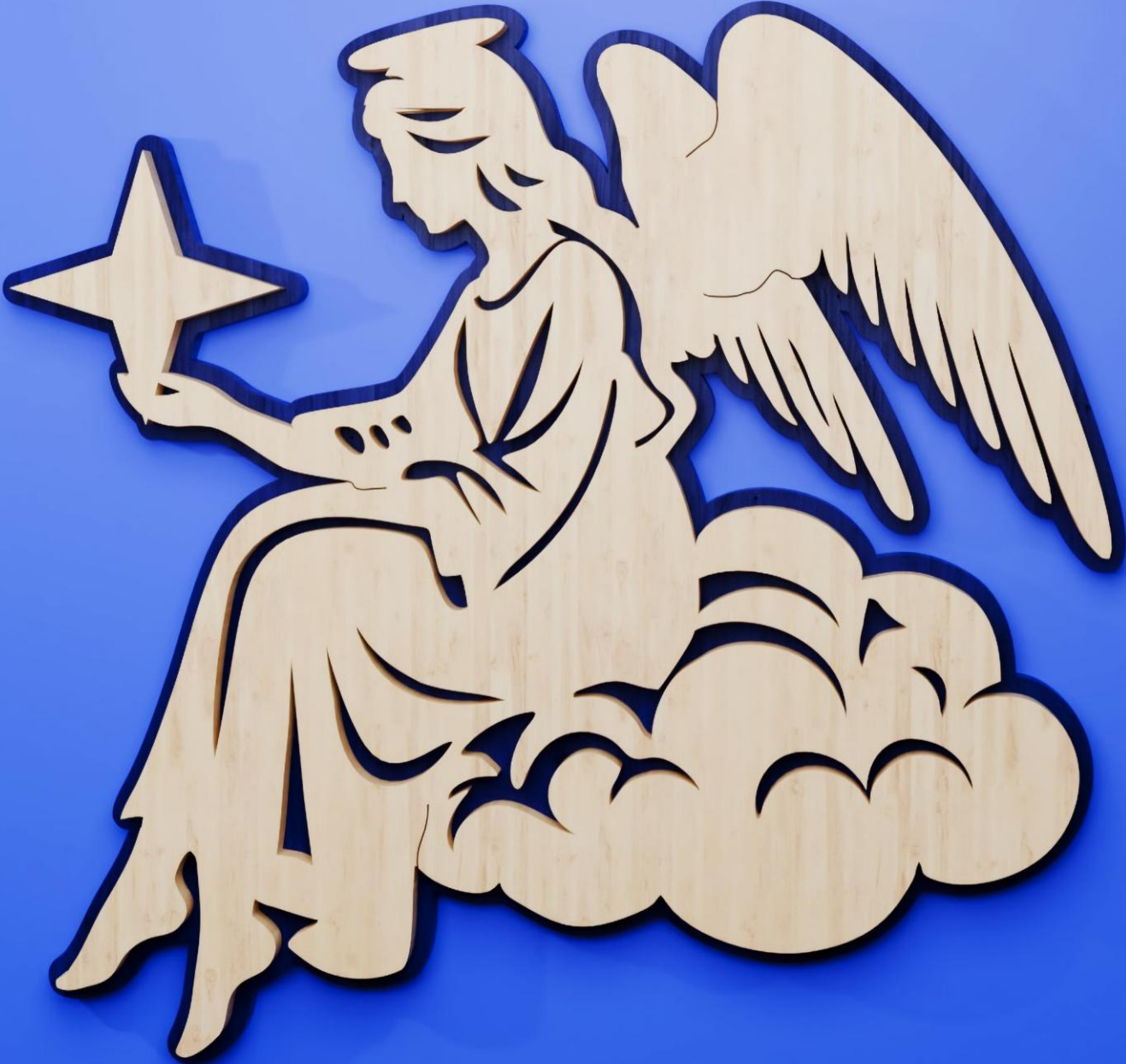
Angel in the clouds