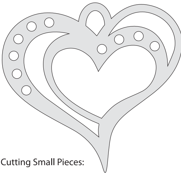
Small Pattern for Pendant

-Cut equal lengths of cord or ribbon and attach them to the top holes to hang.